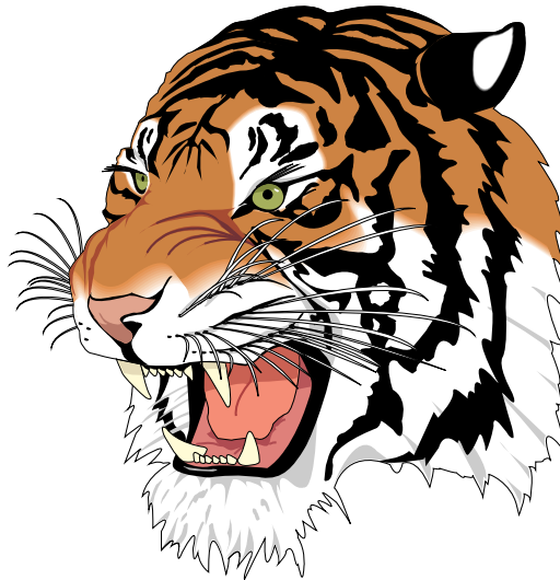
Figure 3. This is the caption of the figure. This is the tiger from the GhostScript distribution.