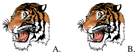
Figure 4. A) This is a figure. B) Second subfigure