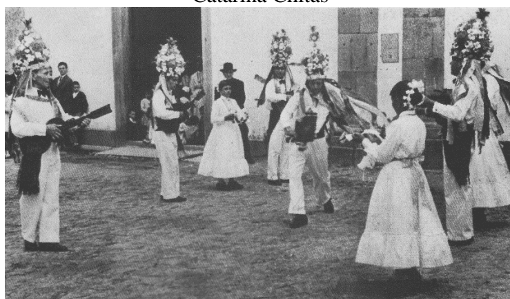
Lousa. Dança dos Homens (Genebres e viola beiroa)