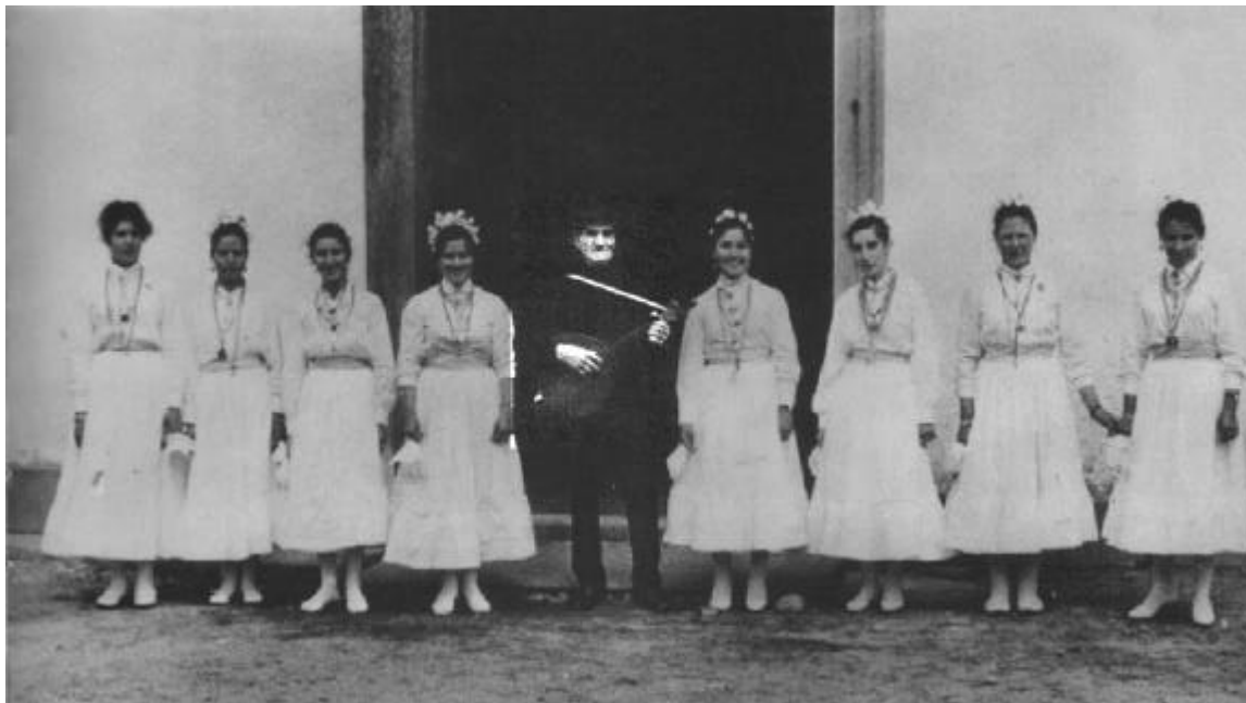
Lousa. Dança das Virgens (Guitarra)